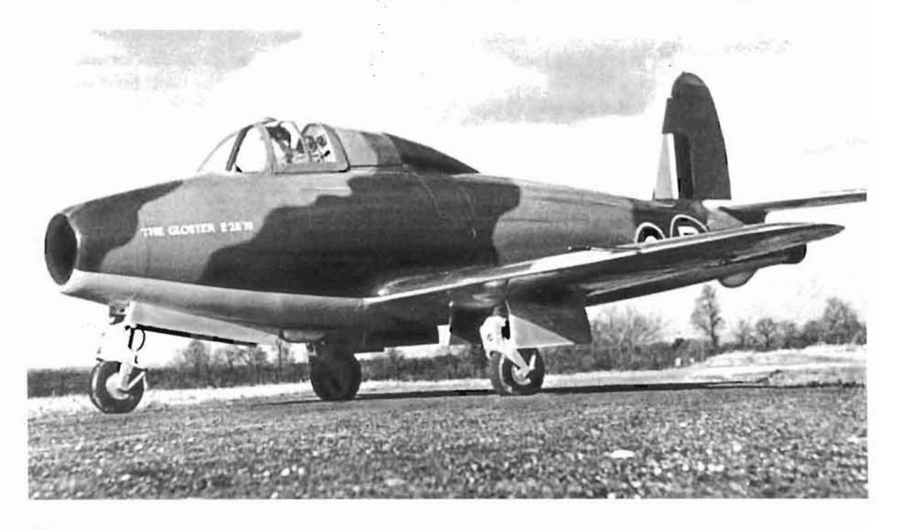
Figure 1 Gloster E28/39, the first British jet aircraft.